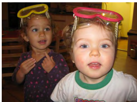
"Come on, Capri! Shark!"