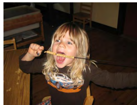
Flint, say "AHHHHHHH"!