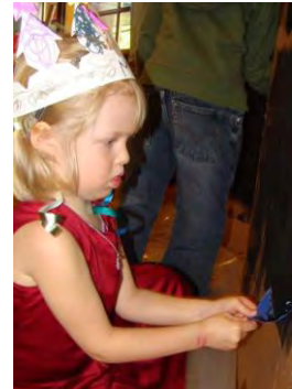
Maya roller painting "The Cave"